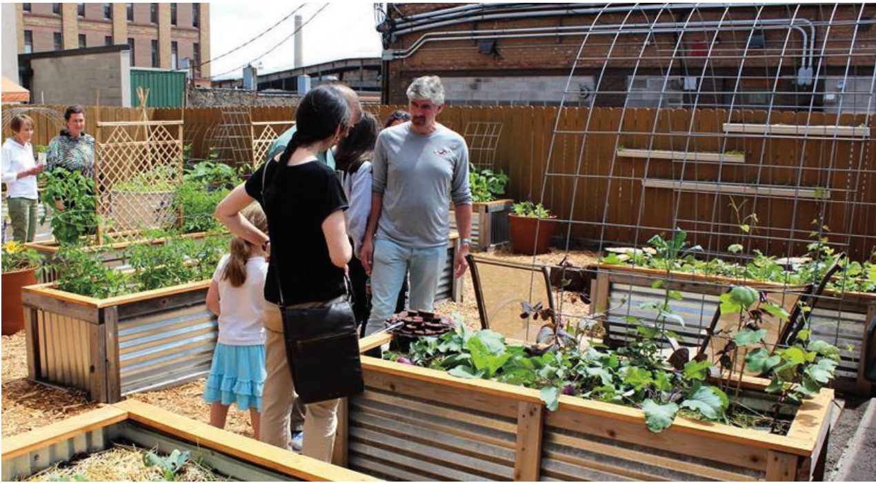
AICHO's Urban Garden that was set up behind the Gimaajii building in a vacant lot.

AICHO starts by providing a safe and comfortable home, with a bet that the youth that Gimaajii supports will grow up to form the core of a healthy community. 18 This change of focus allowed youth and their parents to envision a healthy future. 19 One anonymous interviewee stated: