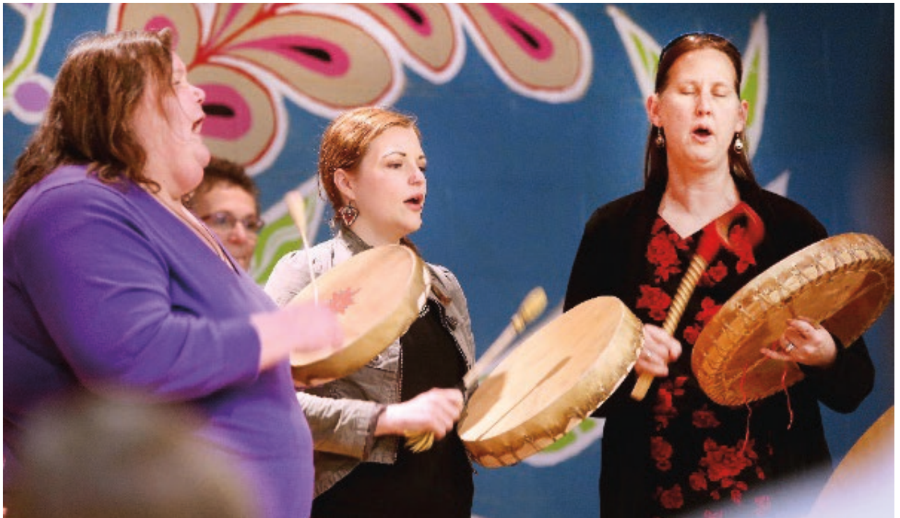
The Oshkii Giizik Singers in a Red Shawl Ceremony, part of a community gathering at the start of Sex Trafficking Awareness Month (January 2017).

Named after an Ojibwe phrase that translates as “we are, all of us together, beginning a good life” Gimaajii-Mino-Bimaadizimin is a community center and 29 units of permanent supporting housing for Native American women and children in downtown Duluth, Minnesota. Many people make up that “we” in Gimaajii, a 50,000-square-foot historic YWCA building, now housing 32,000 square feet of permanent supportive housing, restored and repurposed by the American Indian Community Housing Organization (AICHO). AICHO’s commitment to cultural organizing includes culturally specific programming for residents and other community members. At Gimaajii, this programming happens not only formally in its two art galleries and rooftop garden; Native American culture also permeates every corner of Gimaajii in more subtle ways, from the music on the lobby’s speakers to the smell of sage that wafts through the building.