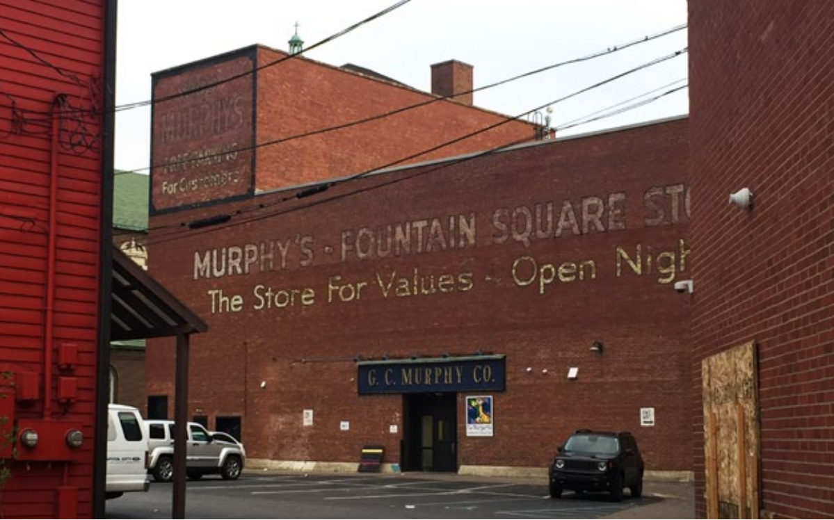
Fountain Square: Murphy Arts Building; Indianapolis, IN.