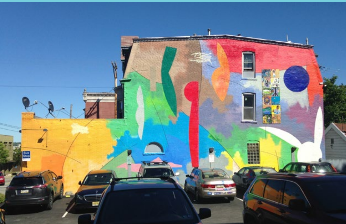
Penn Avenue; Pittsburgh, PA.