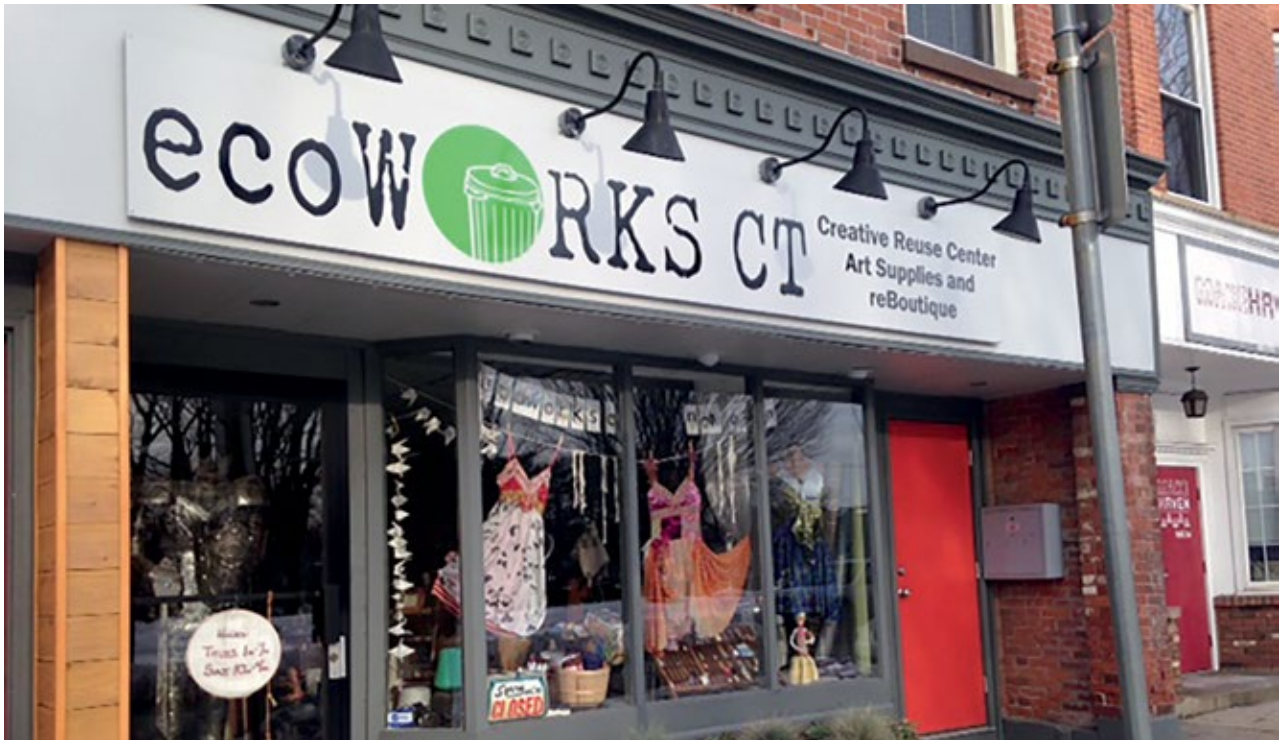
Project Storefronts: EcoWorks Storefront; New Haven, CT