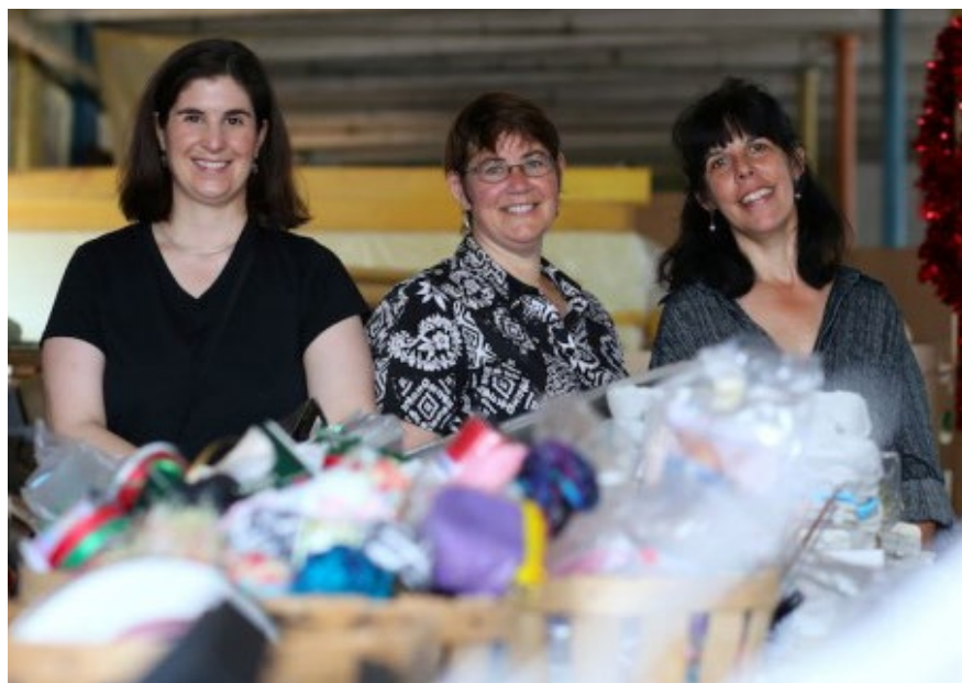
Project Storefronts: EcoWorks; New Haven, CT.

A final cautionary note on promotion of arts or cultural district designation as a marketing device. Fountain Square acquired official cultural district designation and Penn Avenue an unofficial one that successfully highlight their emergence as arts-and-cultural clusters. Yet these types of designation can undermine naturally occurring arts clusters already in place by helping encourage in-migration of high-value uses that drive up rents for artists. And this triggers a related concern over class and racial equity: if the district accelerates a shift into new building uses that nearby residents cannot afford, then who is a revitalized district really for?