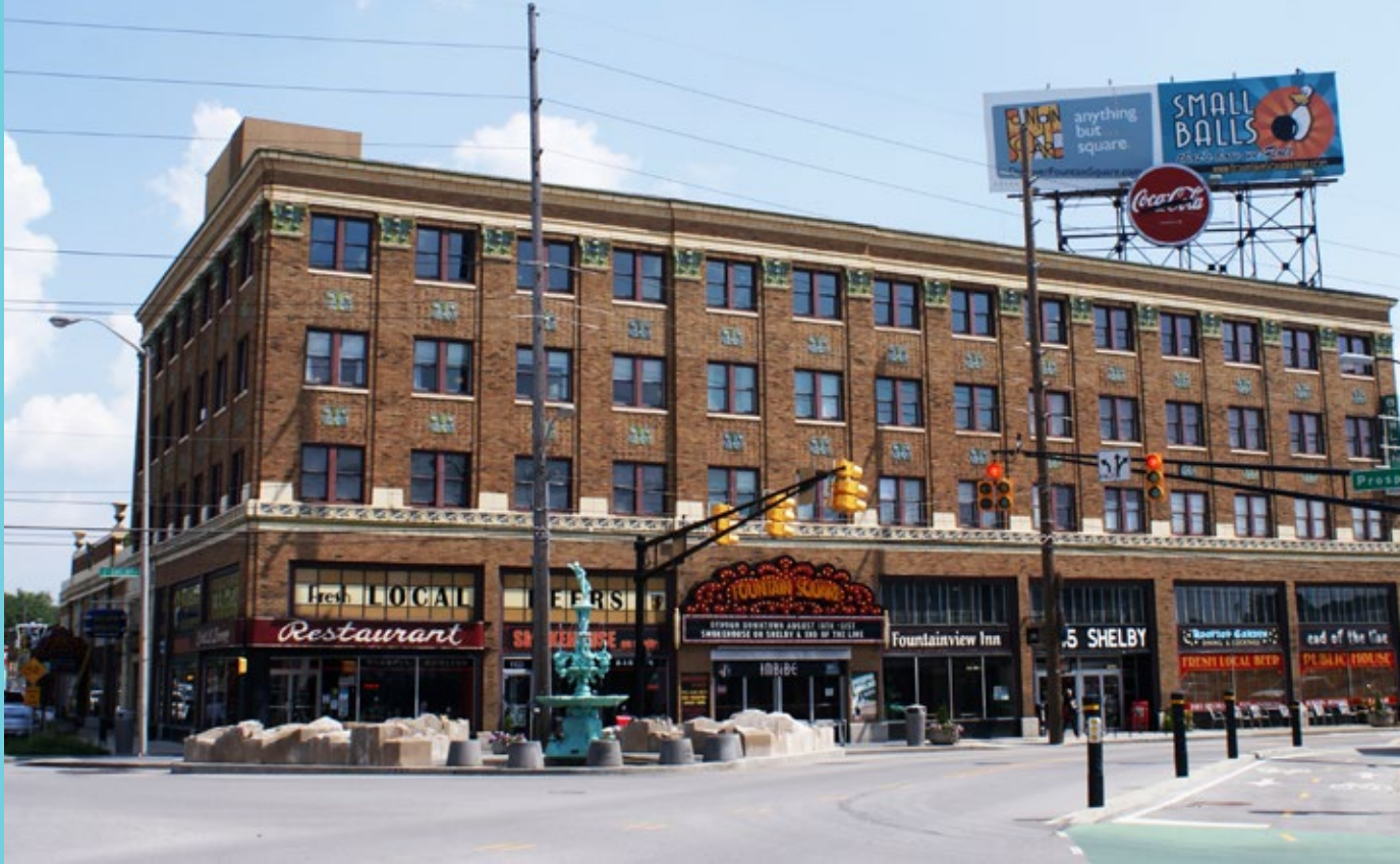
Fountain Square: Fountain Square Theatre Building; Indianapolis, IN.