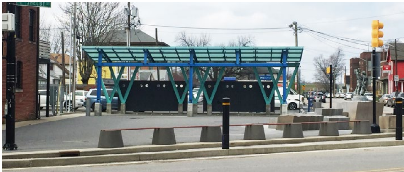
Fountain Square; Indianapolis, IN.

As seen in our case studies, arts-and-cultural efforts can help further each of these goals, generating the kind of benefits that community economic developers most often seek. For instance, public art, public design, historic preservation, and arts-and-cultural events generate popular interest and create and promote an area's unique identity. Exhibit 1 provides an inventory, ranging from start-up of new arts and cultural businesses to invigoration of nearby residential markets.