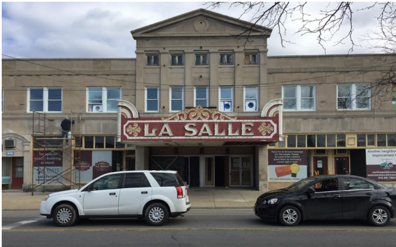
North Shore Collinwood; Cleveland, OH.

Communities, of course, benefit in other ways from the rise of an arts-and-cultural economic cluster, as we discuss in the section on social benefits. Case study communities, and to varying degrees residential communities as well, benefit from a broader range of services, lower crime, more positive perceptions of the community, and at least some cultural recognition compared to what had been the case before the cluster's emergence. In this respect then, equity is served.