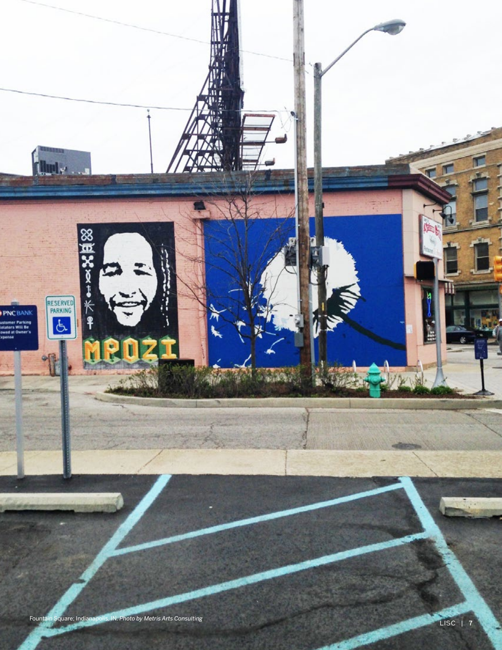
Fountain Square; Indianapolis, IN.