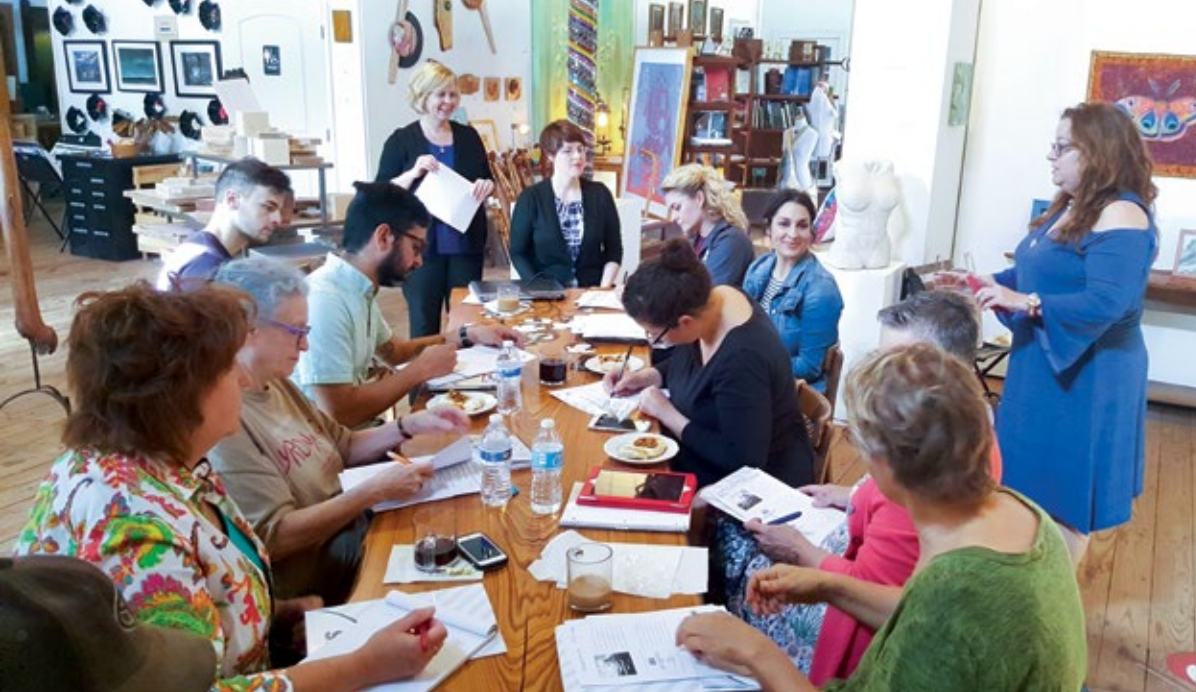
NUNU Arts and Culture Collective: Workshop; Arnaudville, LA