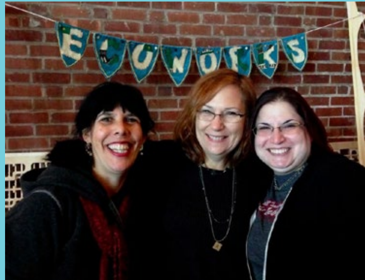
Project Storefronts: Women of EcoWorks; New Haven, CT

Beyond temporary occupancy for business pop-ups, Project Storefronts provides coaching and networking opportunities with other entrepreneurs and launched CityLove (a bike-propelled, mobile retail shop that was