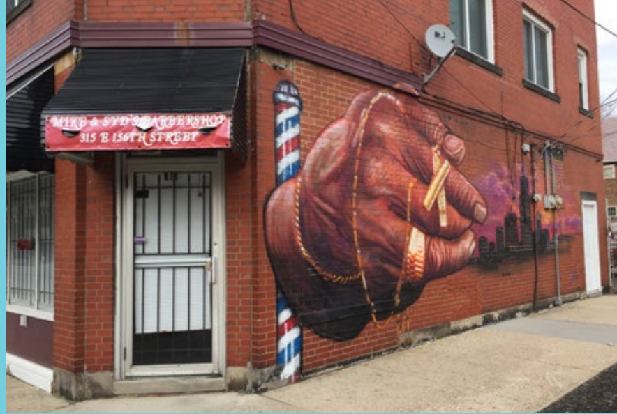
North Shore Collinwood; Cleveland, OH.

Northeast Shores and its partners, including CPAC, also identified ways in which local residents and business owners could have greater agency in shaping their