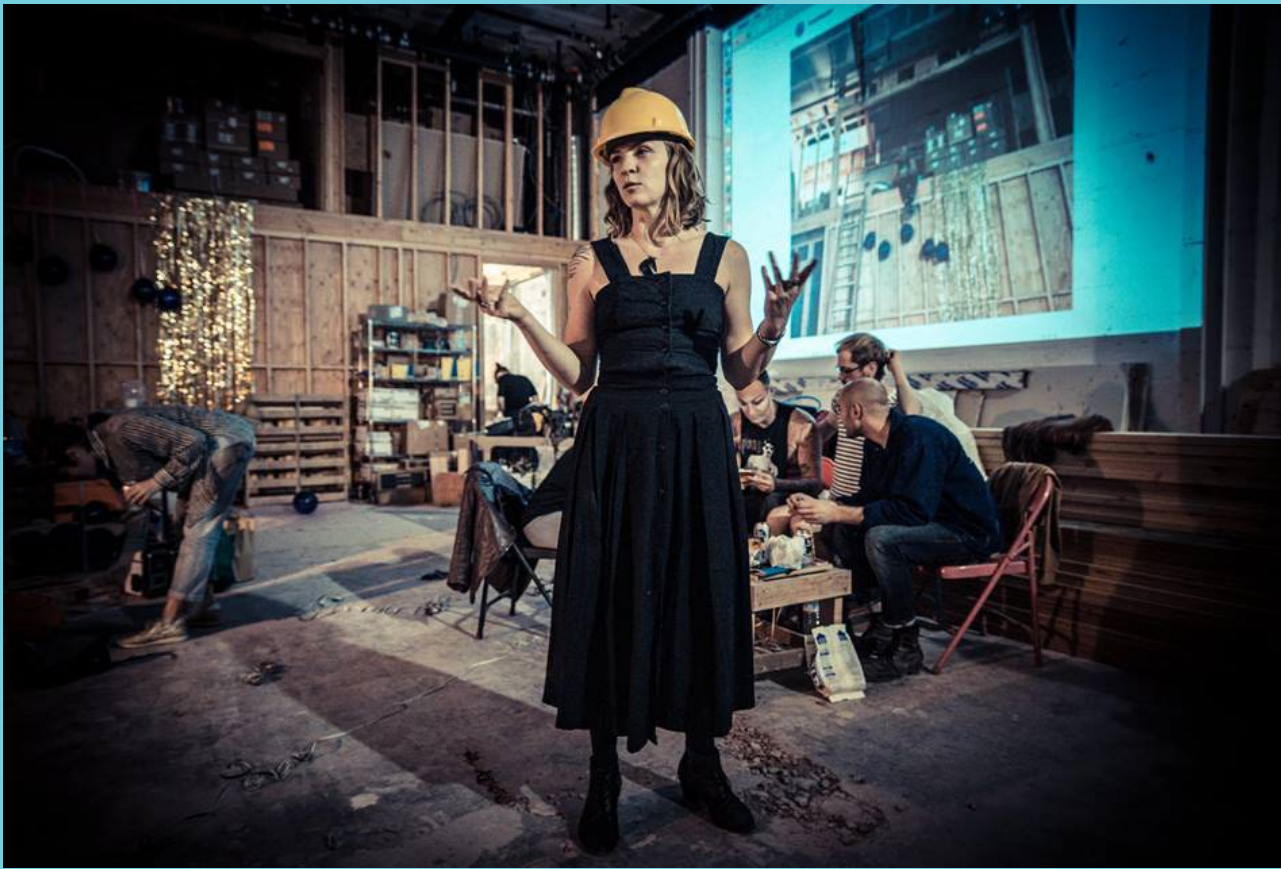
Community Arts Stabilization Trust – CounterPulse: Zombies 2015; San Francisco, CA.