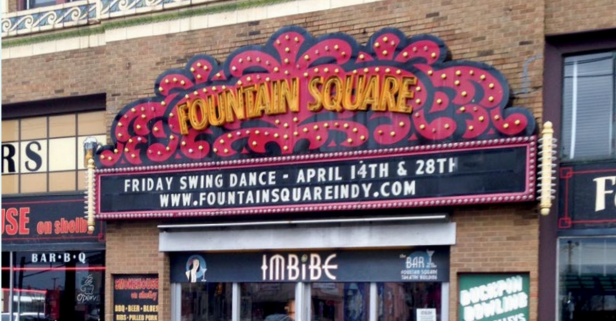
Fountain Square: Fountain Square Theatre Building; Indianapolis, IN.