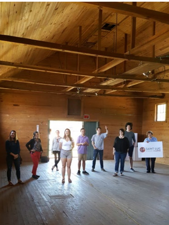
NUNU Arts and Culture Collective: Sur Les Deux Bayous; Arnaudville, LA

that form among business owners and the role community-based organizations play in nurturing and strengthening those ties. As cluster theory would anticipate, maturing arts and cultural clusters expand these relationships among artists, arts organizations, and arts and cultural businesses. In fact, Stern and Seifert argue that “a cultural cluster is best conceived of as a special kind of social network, one in which geographic propinquity is an essential feature.” 28 Recall that economic clusters form, in part, to facilitate exchange of information and support among businesses. We see glimpses of this in our case examples. The NUNU Collective in Arnaudville acts as a central node in a productive network of artists and culture bearers, and on Penn Avenue, a small group of black-owned arts organizations and businesses have forged a number of supportive ties among them.